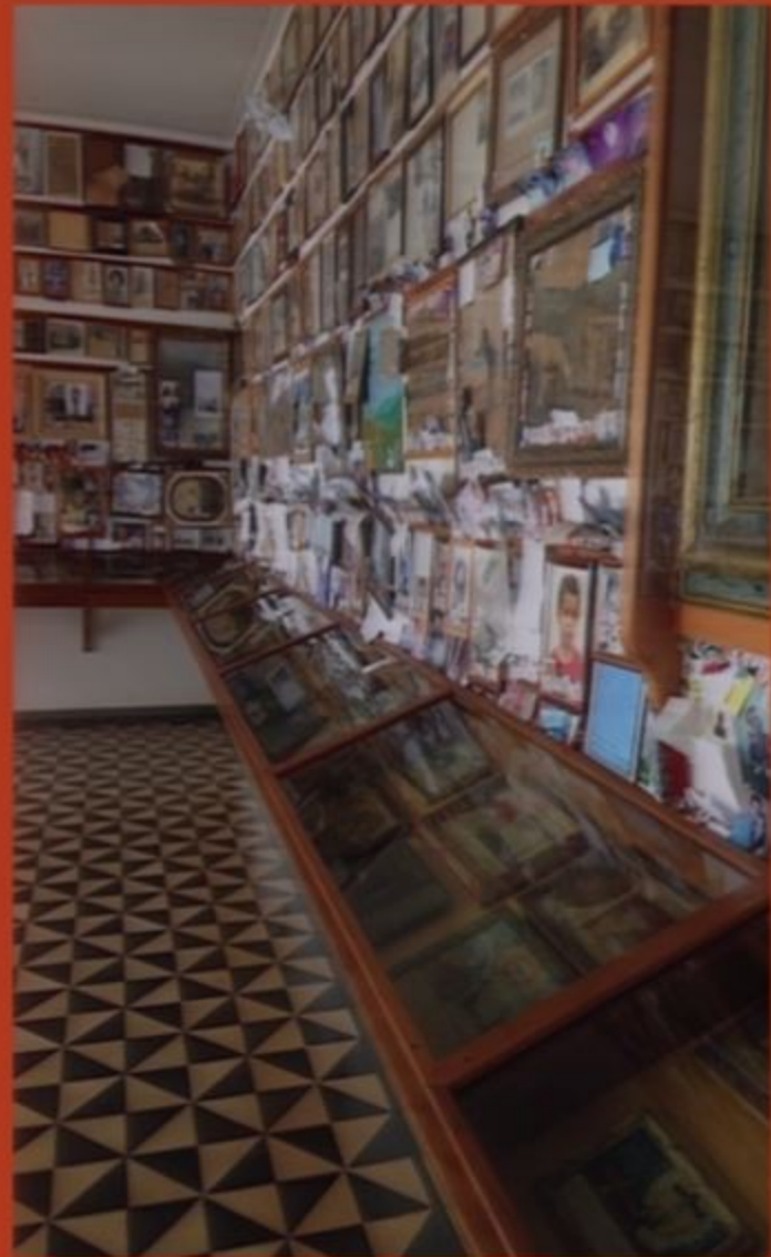
Santuário do Bom Jesus do Matosinhos, Congonhas, Brazil