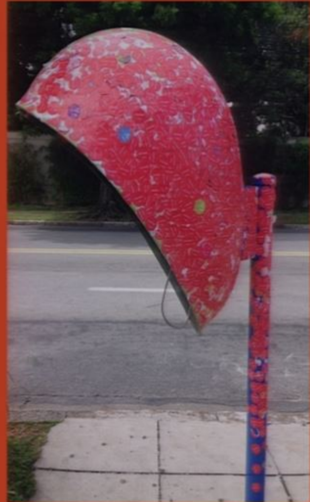
Phone booth outside of Museu da Imagem e do Som de São Paulo, Brazil (MIS)