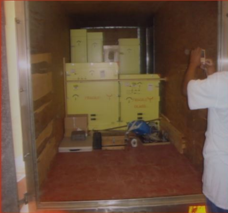
Minimal bracing on truck in the Dominican Republic

Who has travelled to Latin America as a courier?