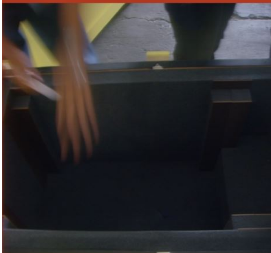
Foam insulation being checked for contraband by Dominican Republic customs (with knife)