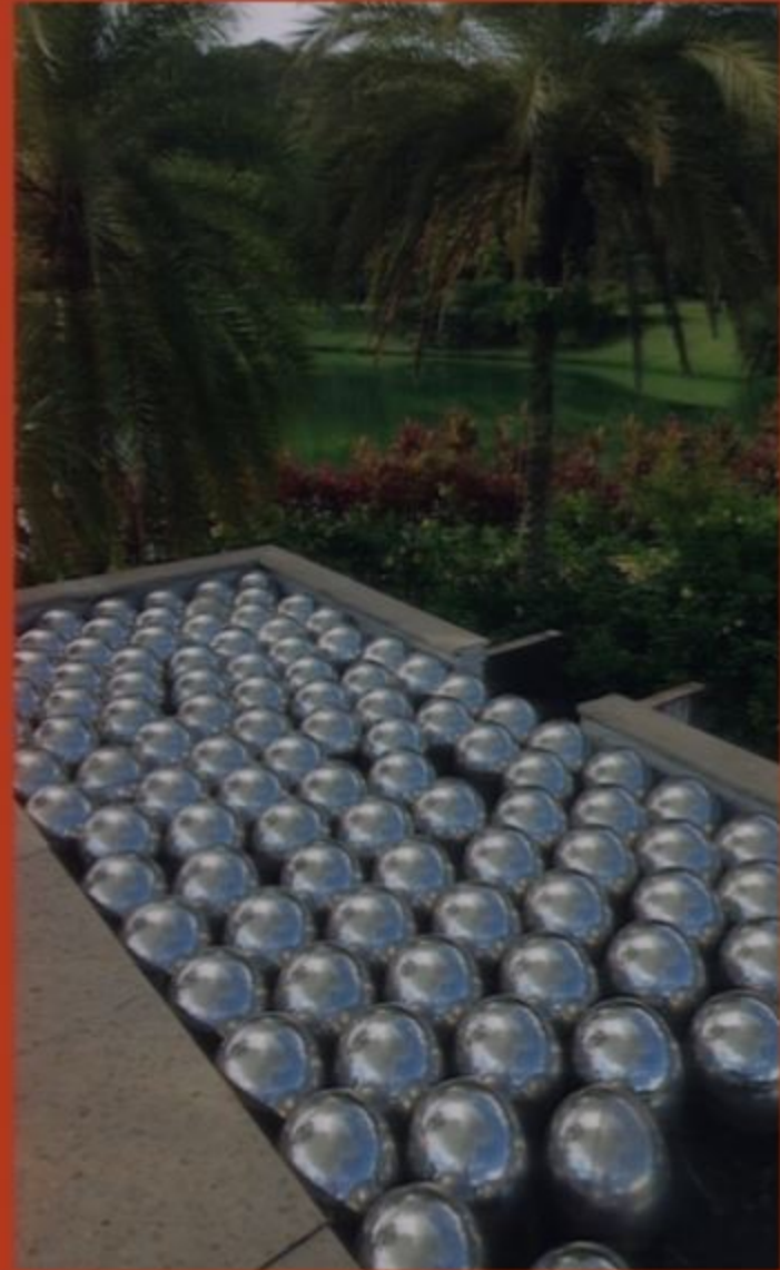
Kusama installation, Inhotim, Brazil

At this point, we would like to open the floor to discussion and any questions you may have regarding shipments or cultural exchange with Latin America.