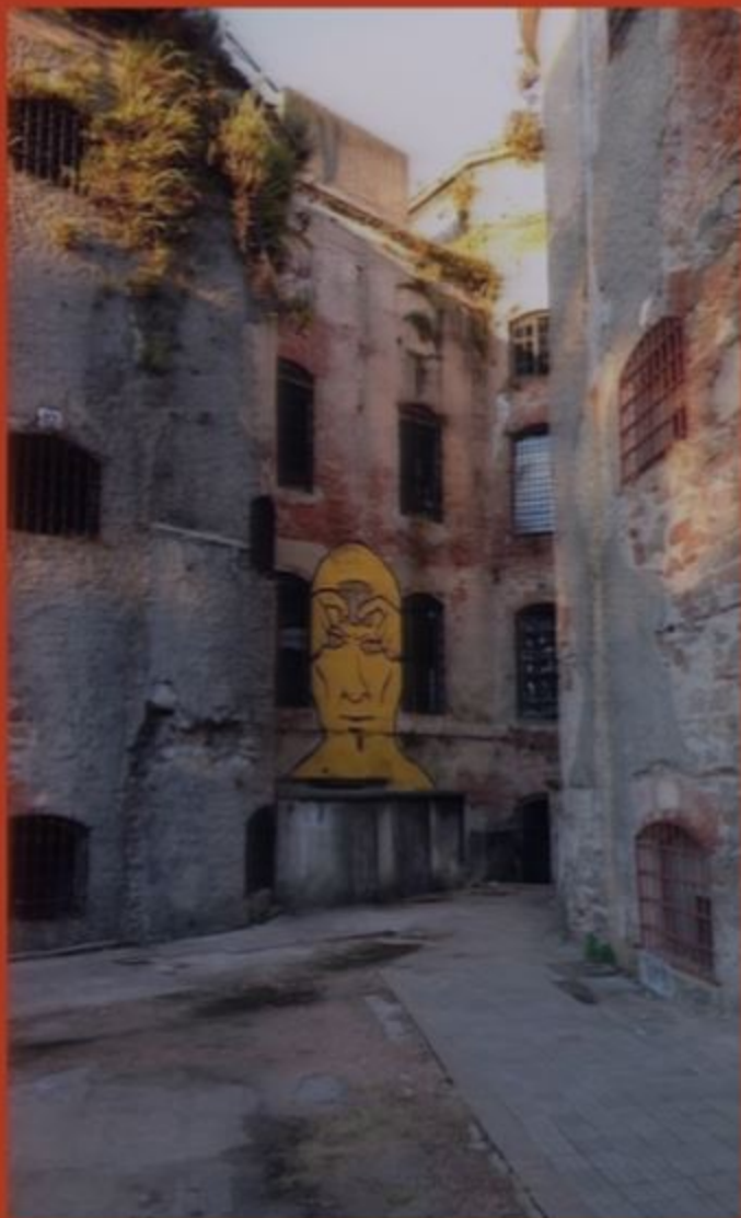
Espacio de Arte Contemporaneo, Montevideo, Uruguay – inside a former prison

Did you expect that the trip was going to be complicated prior to your departure?