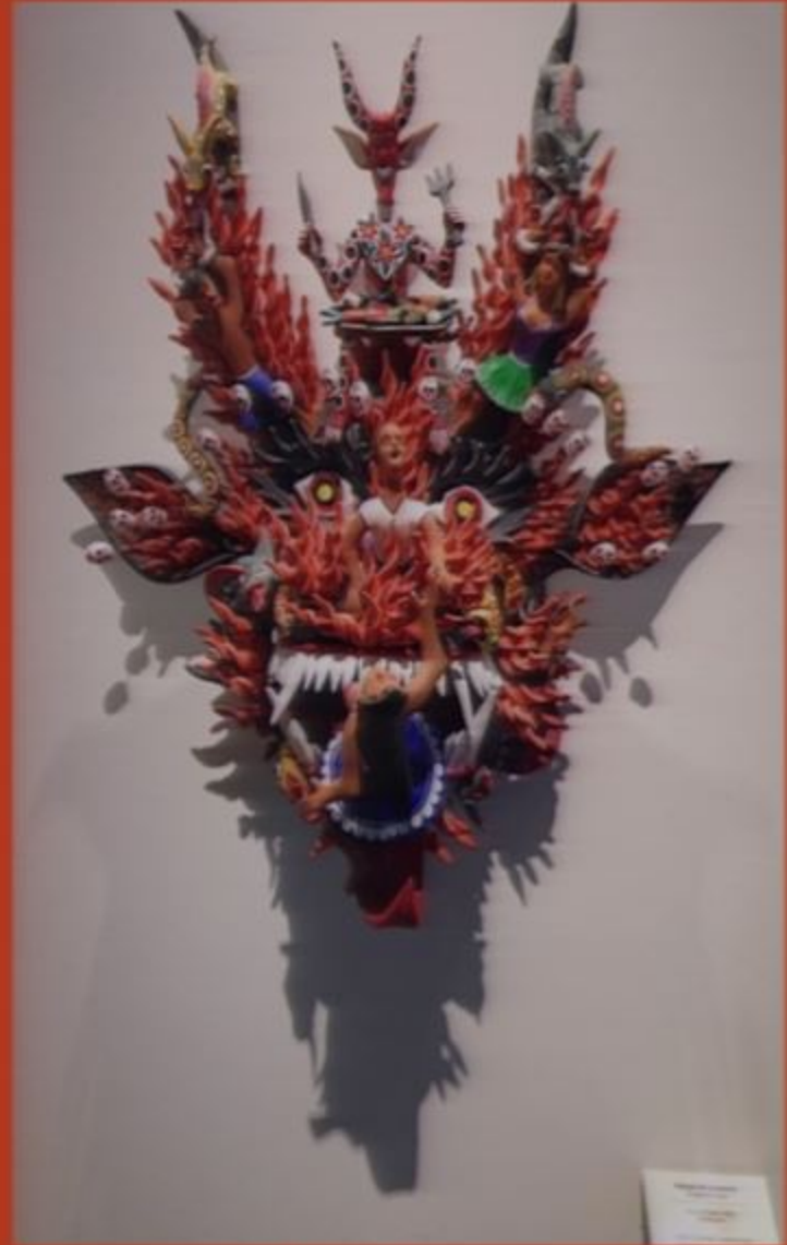
Museo de Arte Popular, Mexico City

In one word – how would you describe your overall experience?