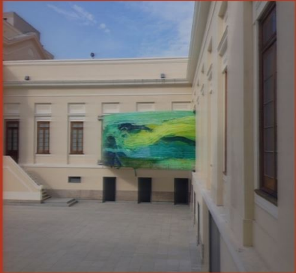
Casa Daros, Rio de Janeiro, Brazil