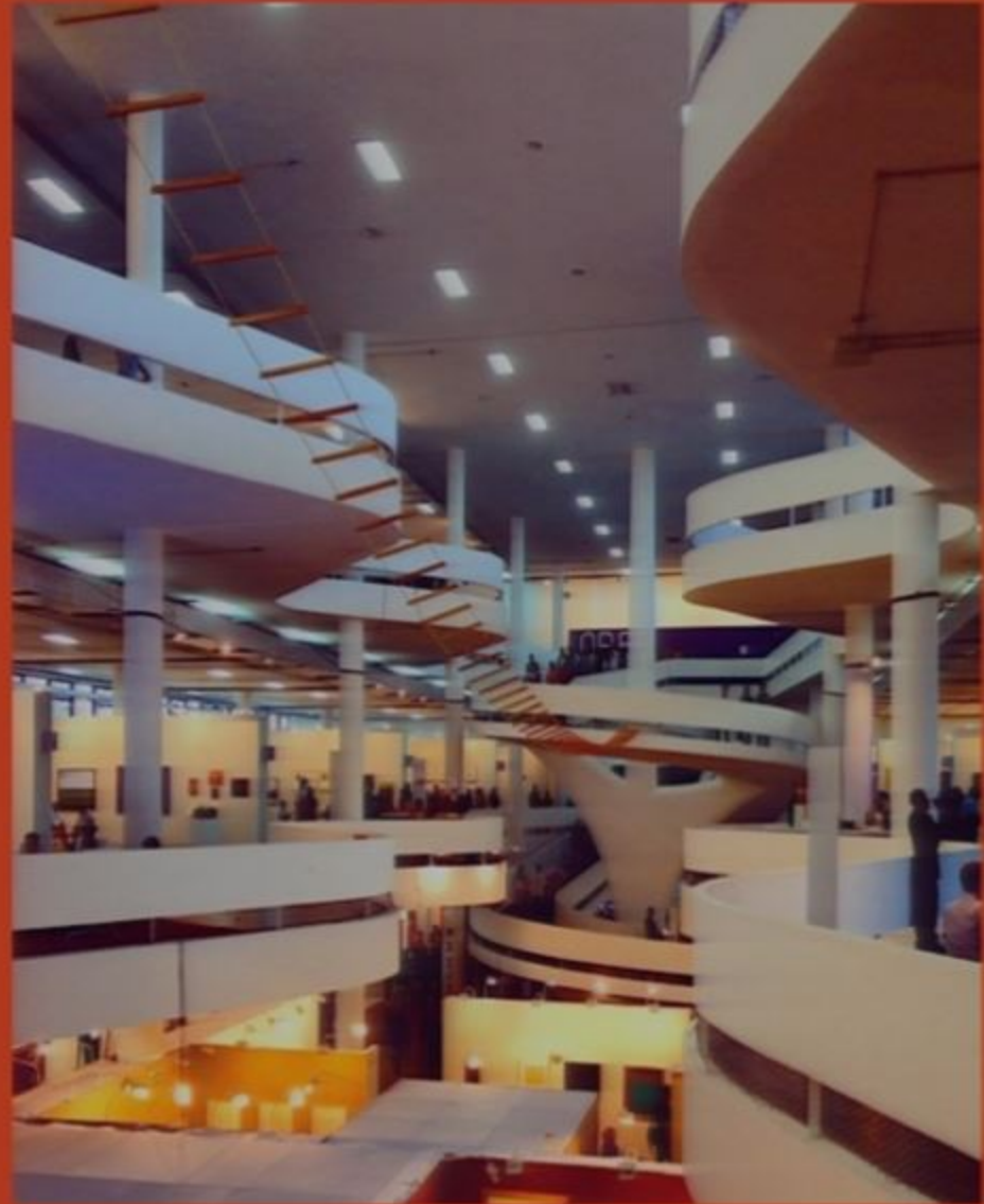
SP Arte 2015, Parque Ibirapuera, São Paulo, Brazil