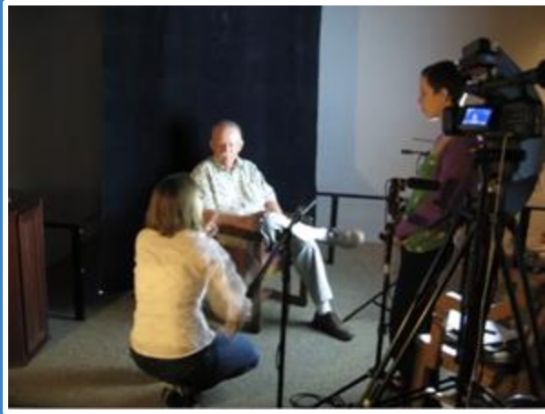
"Choosing Recording Equipment"