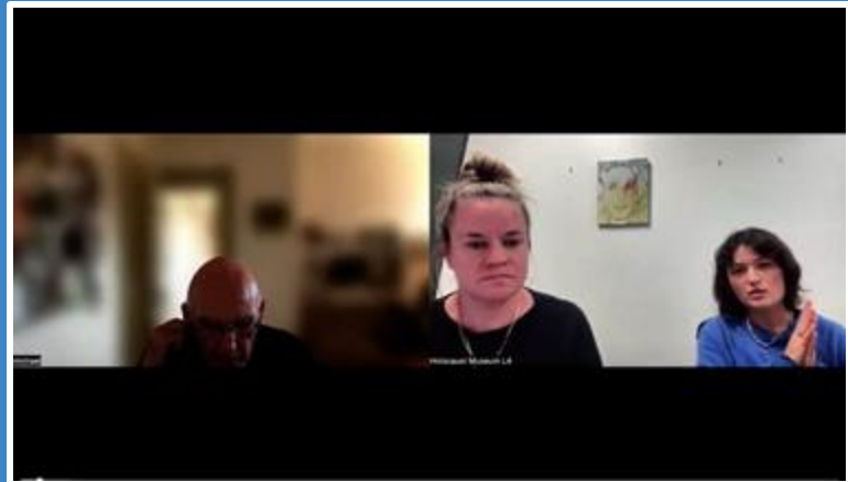
Institutional Oral History AV.0011.001-2, December 17, 2024