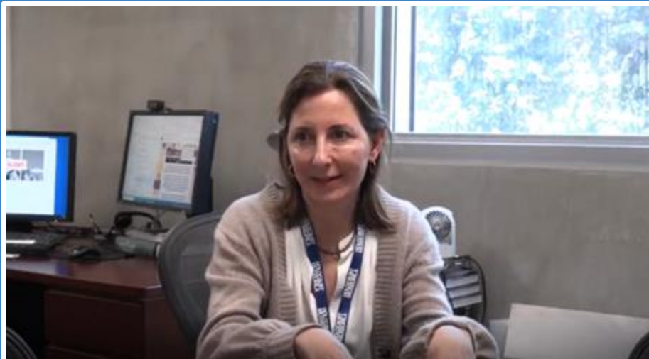
Institutional Oral History AV.0011.010, May 14, 2025