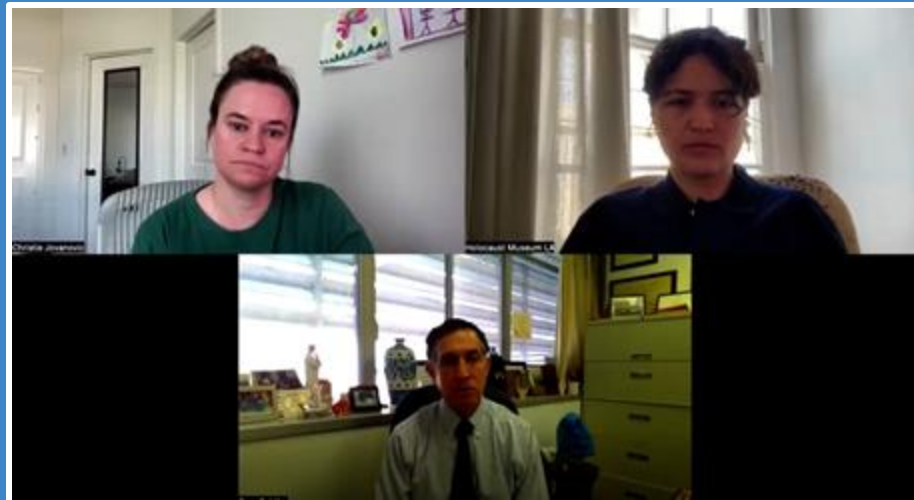
Institutional Oral History AV.0011.005, January 28, 2025