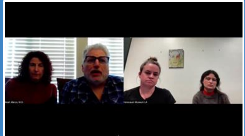
Institutional Oral History AV.0011.003, January 6, 2025