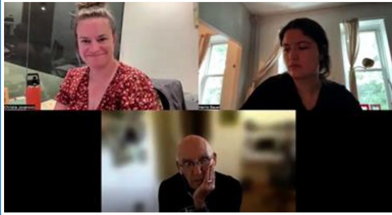
Institutional Oral History AV.0011.001, June 12, 2024